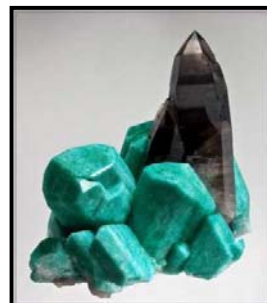
Amazonite & Smoky Quartz.